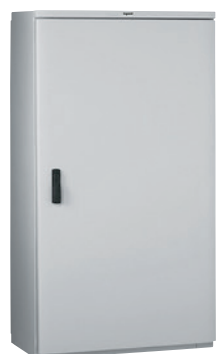
0 362 85