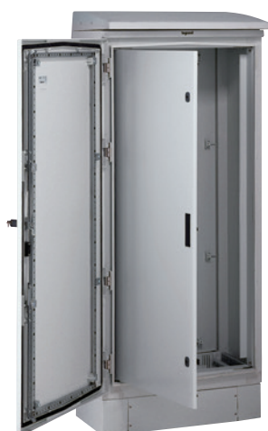
0 362 86 with plinth Cat.No 0 362 96 internal door Cat.No 0 363 67 and roof Cat.No 0 362 97